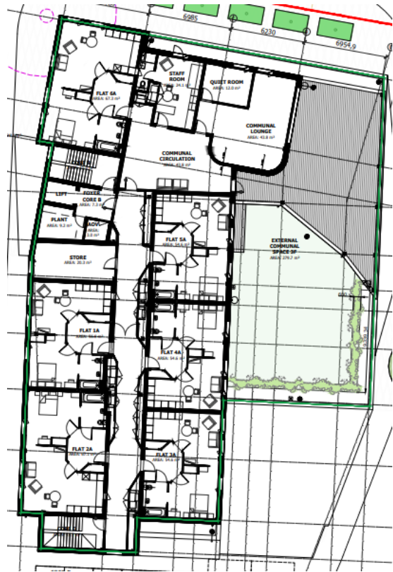
Proposed Third Floor Plan: