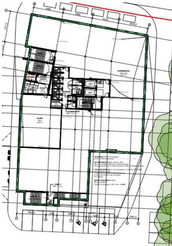
Proposed Second Floor Plan: