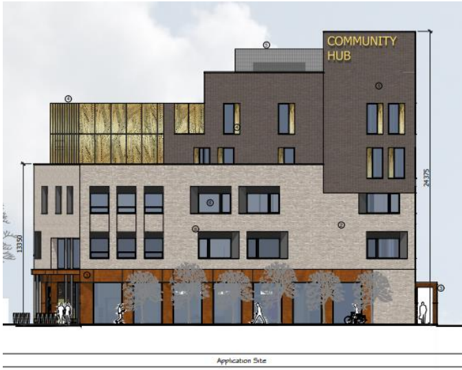
Proposed North Elevation: