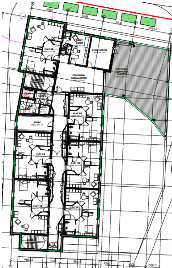
Proposed Fourth Floor Plan: