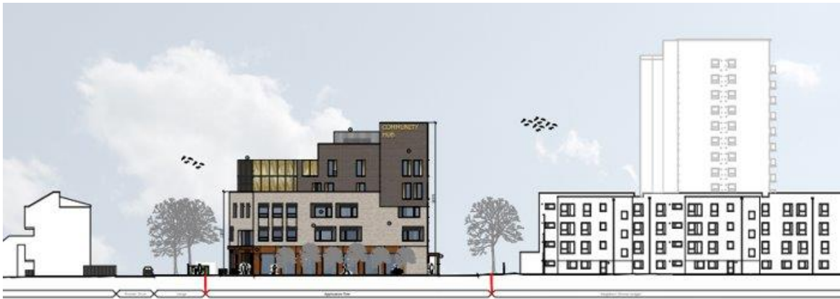
ELEVATION WEST (B-B)